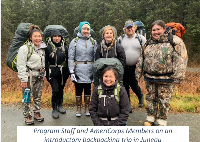
Program Staff and AmeriCorps Members on an introductory backpacking trip in Juneau

Thank you for considering a position as a Resilient Alaska Youth AmeriCorps member. This is an opportunity to impact youth in your community, create safe, positive activities, and encourage healthy choices.